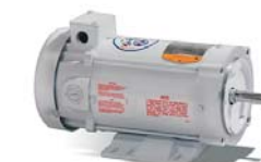
PM DC Motor