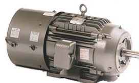
AC Vector Motor