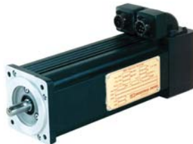
Brushless DC Motor