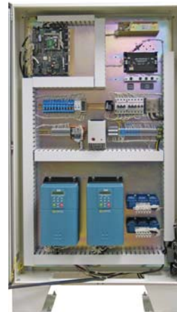
Outdoor SCR PDU