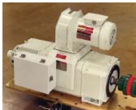
Shunt Field DC Motor